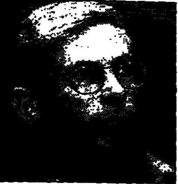
'Knighted': Ze'ev B. Begin